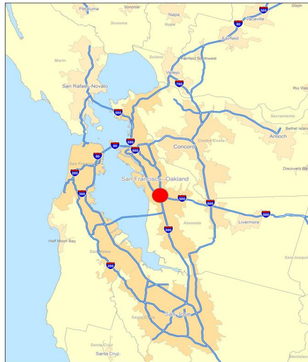
Figure 1: Location Map