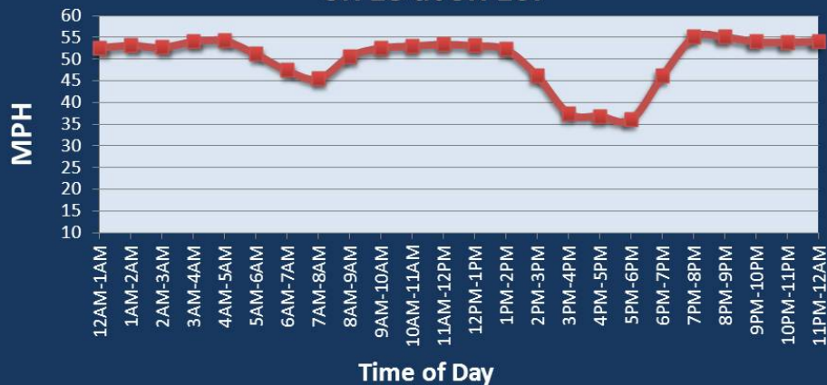
Average Speed by Time of Day SR 18 at SR 167