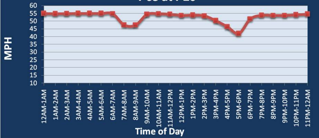
Average Speed by Time of Day I-65 at I-20