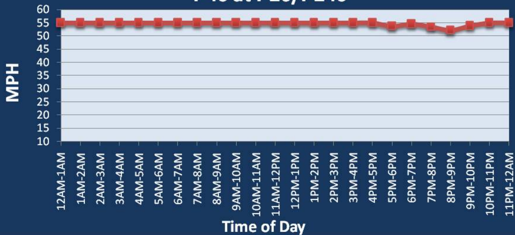
Average Speed by Time of Day I-40 at I-26/I-240