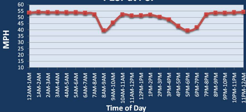
Average Speed by Time of Day I-287 at I-87