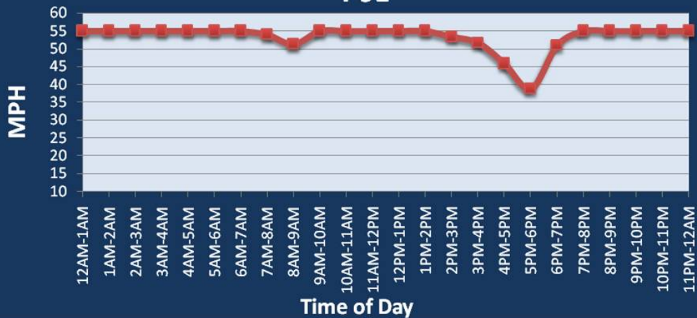
Average Speed by Time of Day I-91