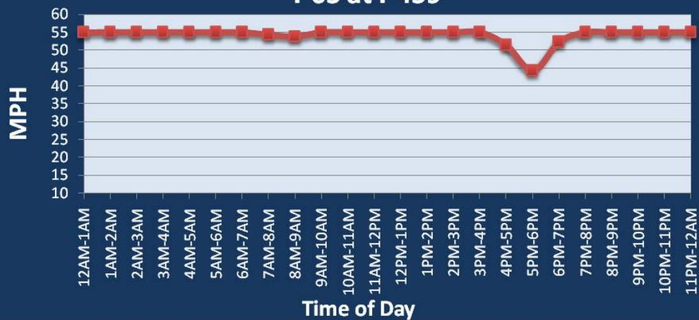
Average Speed by Time of Day I-65 at I-459