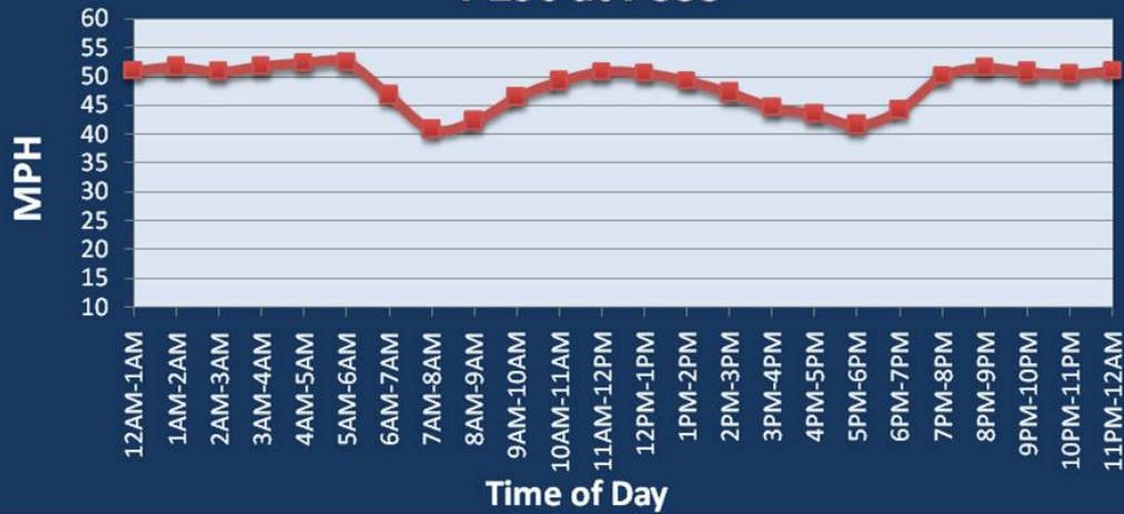
Average Speed by Time of Day I-290 at I-355