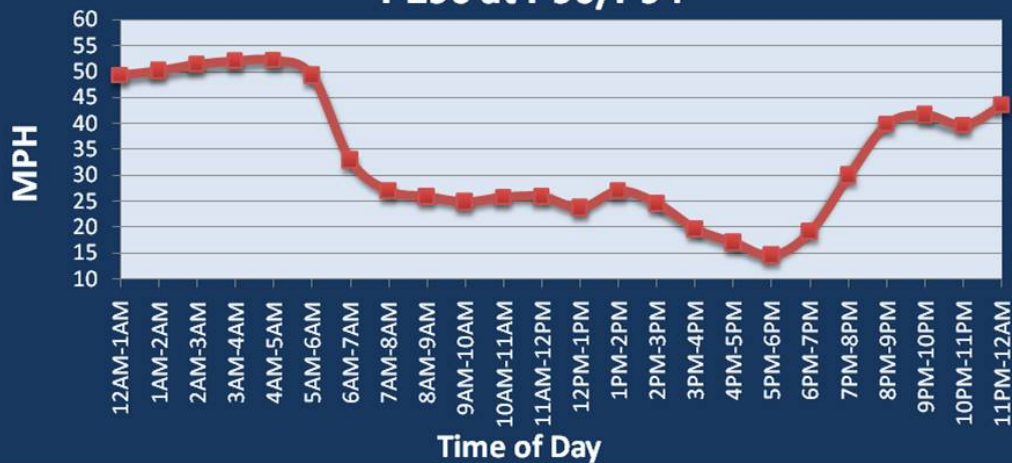
Average Speed by Time of Day I-290 at I-90/I-94